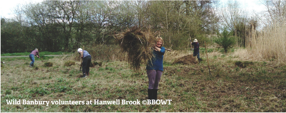
Wild Banbury volunteers at Hanwell Brook