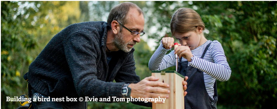
Building a bird nest box

Local Nature Recovery Strategies (LNRS) LNRS will set out and map priorities for nature's recovery in each of 48 areas in England. BBOWT is working with local authorities and other organisations on preparing LNRS across our three counties.