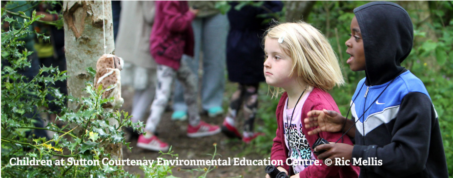
Children at Sutton Courtenay Environmental Education Centre.