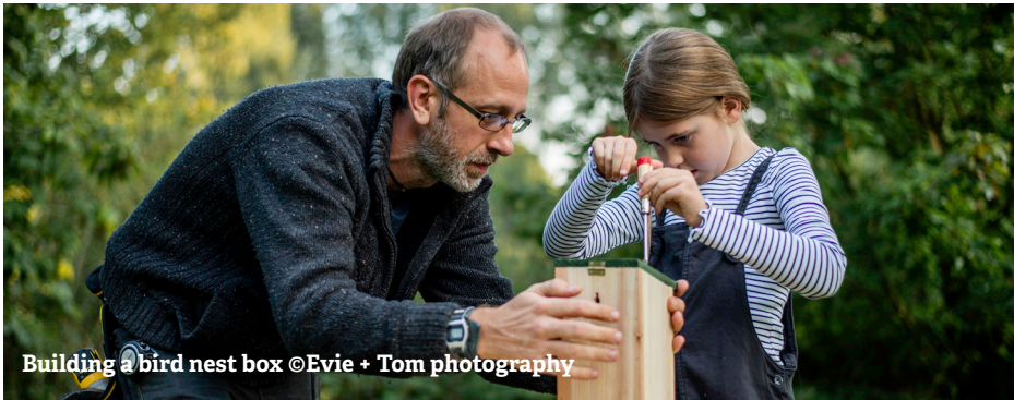
Building a bird nest box